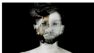
Hey Changeling (from Be Yourself in 11 Easy Lessons ) released 30 April 2021