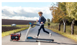
Walking to Alpha Centauri (from Be Yourself in 11 Easy Lessons ) released 5 March 2021